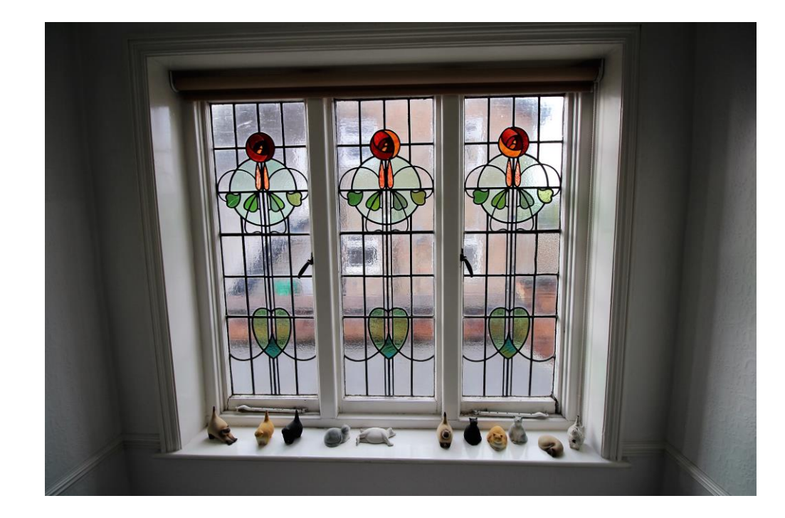
Original Stain glass window